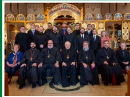
Seminary group photo for the 2024-2025 Academic Year