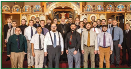
Clergy, Seminarians and Retreatants of the Fall 2024 “Come and See” Weekend of Discovery Retreat

Every young man eventually has to make some hard decisions – college, career, marriage, family, religious life. He might ask: How do I know what’s right? Does God care what I decide? Such men, ages 18 to 35, single or married, are invited every fall to our annual “Come and See” Weekend of Discovery Retreat as an aid to discerning a vocation to the priesthood in the Byzantine Catholic Church. Last fall, a total of 13 candidates representing the four Ruthenian (arch)eparchies and the Melkite Eparchy came together for a weekend of learning, worshipping, and sharing in community life with the seminarians in a “no pressure, no hard-sell” environment. The atmosphere was prayerful, positive, and fraternal, with the offering of seminarians reflecting the four dimensions of priestly formation – human, spiritual, intellectual, and pastoral – containing specialized topics including the married and celibate priesthood, liturgical and individual prayer and spirituality, and intellectual requirements for priesthood. For more on what took place, please refer to: https://bcs.edu/come-and-see-2024/ . If you are discerning a call to the priesthood or the diaconate, please contact your Father Pastor, along with your Eparchial Vocations Director at our Seminary website at https://bcs.edu/contact-vocation-director/ .