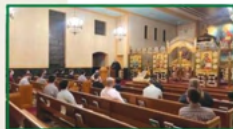
Presentation on Formation