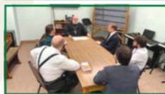
Discerning Celibate Priesthood