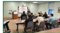
Discerning Married Priesthood