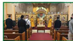
Celebrating the Divine Liturgy